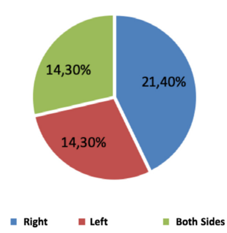
Figure 2. Prevalence of dynamic valgus in FAPI runners diagnosed by step down test

Angle Q is the formation of two imaginary lines, one of these lines departing from the anterior superior iliac crest to the middle of the patella and the other part of the anterior tibial tuberosity to the center of the patella<sup>13</sup> when enlarged is a factor of triggering ACL injury rates among athletes<sup>9</sup>.